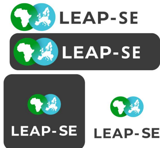
Figure 2: LEAP-SE logo variants