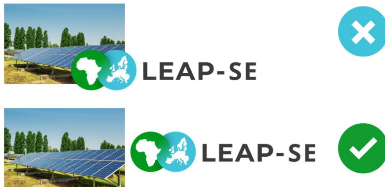
Figure 4: How to use the logo

In text, the project call should be referred to as “LEAP-SE”.